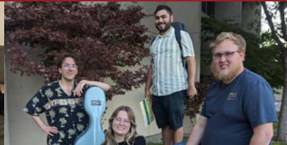
Friends of MGF provide string quartet music.