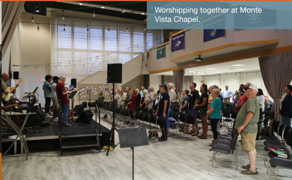
Worshipping together at Monte Vista Chapel.