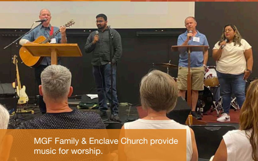
MGF Family & Enclave Church provide music for worship.