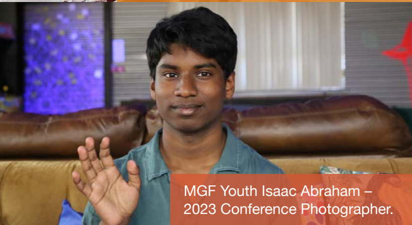
MGF Youth Isaac Abraham – 2023 Conference Photographer.